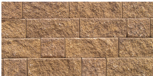
Ultra - Standard - Cobble Pattern

VERSA-LOK Ultra units create additional options for random-pattern walls.