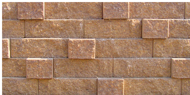
Ultra - Cobble Pin-Forward Pattern

Expand your opportunities with Ultra, the newest member of the VERSA-LOK family.