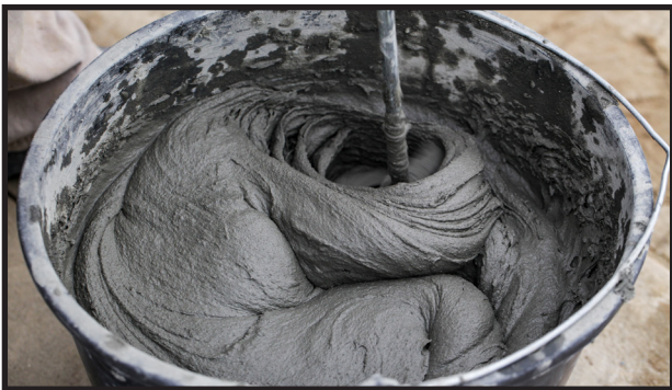
Use Tenon™ Set Retarder in warm weather where extended working time is needed for proper placement

Also check out our Tenon™ Concrete Patching Mix!