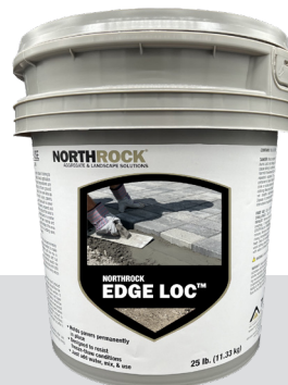
25 lb. pail