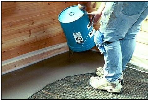
Pouring Self-Leveling Floor Underlayment Cement across floor