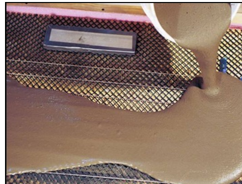
Self-Leveling Floor Underlayment Cement on top of Plastic Lath with radiant heat cables