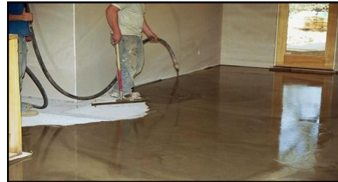
Applying Self-Leveling Floor Underlayment Cement thru a pump