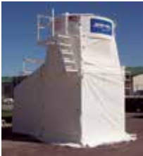
SINGLE BUMP OUT SILO ENCLOSURE