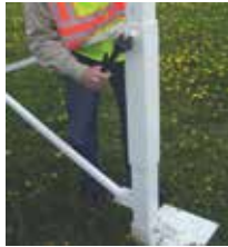
SILO LEG EXTENSIONS