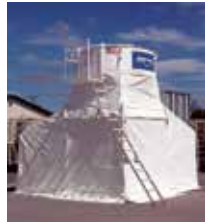
DOUBLE BUMP OUT SILO ENCLOSURE