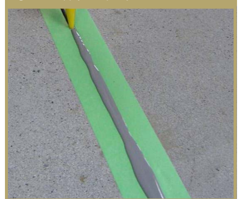
Figure 3: Apply to taped joint