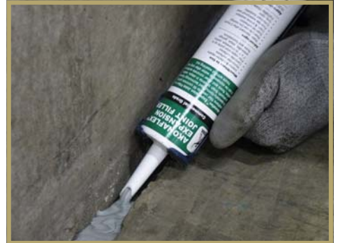
Figure 1: Apply with standard caulk gun

Avoid contact with eyes and skin. If contact with eyes occurs, flood eyes repeatedly with clean water and see a physician immediately. Do not rub eyes. Wash hands thoroughly after handling or before eating with warm, soapy water. Do not take internally. Keep out of reach of children.